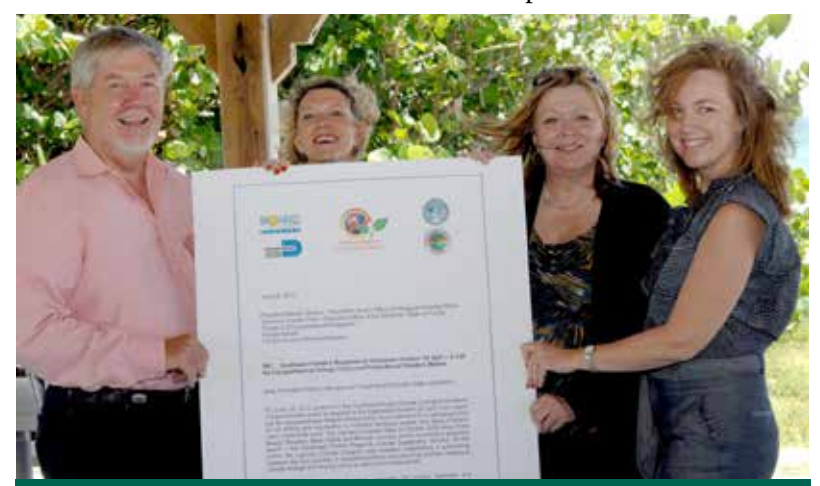
On June 24, 2010, partners in the Southeast Florida Climate Compact convened a regional press event to respond to the Deepwater Horizon Oil Spill in an urgent call for comprehensive federal energy policy and a demand for a permanent ban on oil drilling and exploration in Florida's territorial waters and along Florida's outer continental shelf.

Adaptation Action Area designation for areas vulnerable to the impacts of climate change, and the subsequent request by members of Congress to amend federal law to mirror this action are just a few examples of the Compact's success to influence policies. The Regional Climate Action Plan provides the next step to gain support for ordinances, regulations and state and federal policies on behalf of the region. The Public Policy goal complements numerous other recommendations noted in the Sustainable Communities and