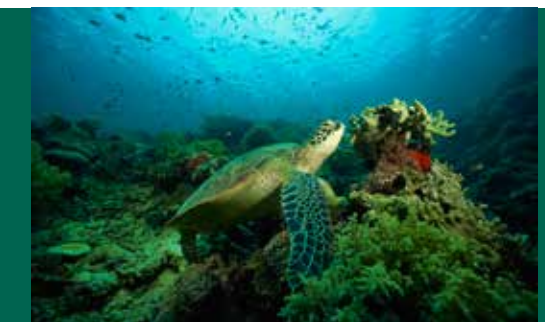
... important to Southeast Florida's culture, economy and distinctive sense of place.