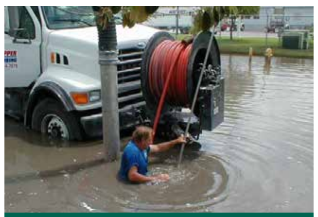
Recommendation: Mitigate climate change on water supplies, water and wastewater infrastructure, and water management systems.

Foundations) as sources of important research, reports, and information regarding climate change, and efforts being undertaken in other communities.