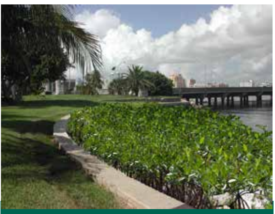
The regional scale of the resilience strategies effectively integrate human and natural systems

The Compact paved the way for early work in 2010 to develop the unified regional baseline and sea level rise planning scenarios. Summaries of these work products are provided in Section IV. This early work served as the foundation for the development of this regional framework through three Work Groups: Built Environment, Transportation, and Land and Natural Systems. These Work Groups were chaired by Staff Steering Committee members and expanded to include local and regional experts from the public and private sectors and academia.