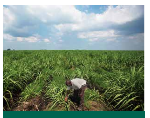
Consideration of agricultural impacts is vital to any regional action plan.

Southeast Florida is unlike any other growing area in the nation due to a 12-month growing season and ample local market potential. More than 250 different and unique crops grow in Southeast