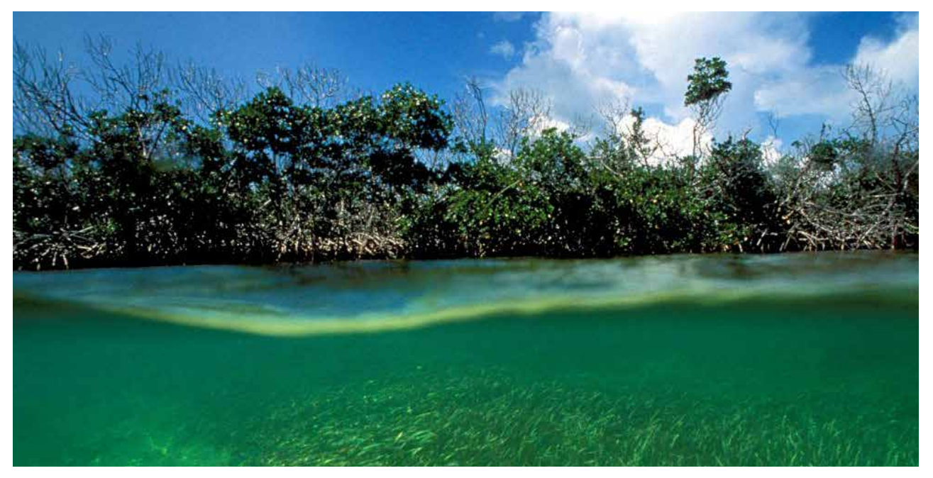
Southeast Florida Regional Climate Change Compact Counties - Regional Climate Action Plan

Coral reefs are vital to local fisheries and the economy. Healthy oceans provide most of the oxygen in the air we breathe. Much research is already underway regarding the impact of climate change on the world's oceans. Locally, strategies are being developed to maintain our ocean in the face of climate change. In estuarine systems, mangroves and seagrasses are primary converters of sunlight energy to food energy. However, they are both limited