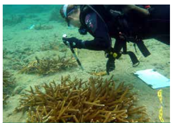
Goal: Implement monitoring, management, and conservation programs designed to protect natural systems and improve their capacity for climate adaptation.

sustainable funding mechanism for their protection and management.