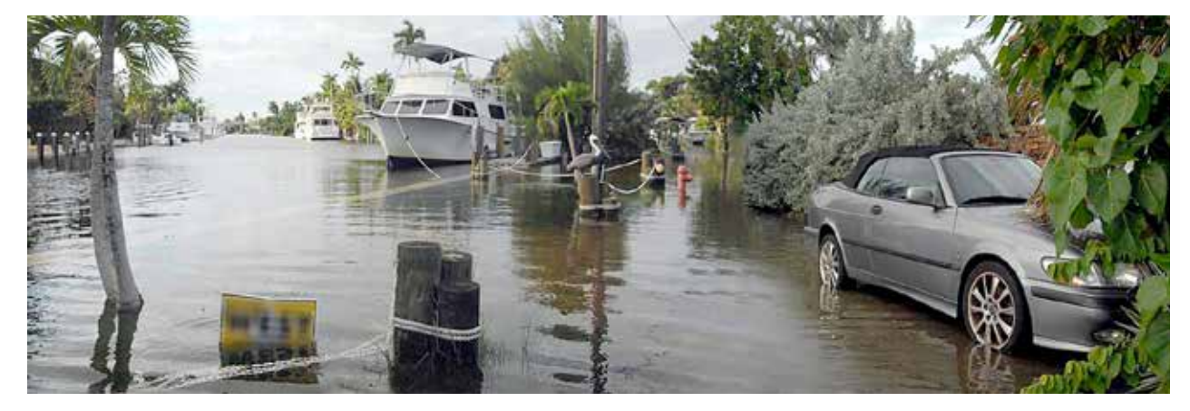
Southeast Florida Regional Climate Change Compact Counties - Regional Climate Action Plan