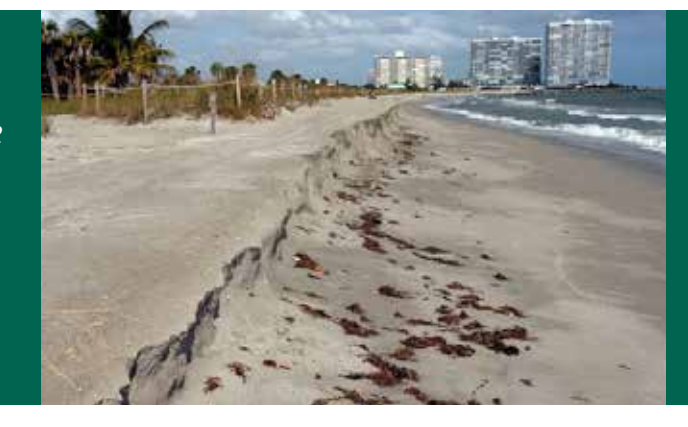
with values rising to more than $31 billion at the three-foot SLR scenario.