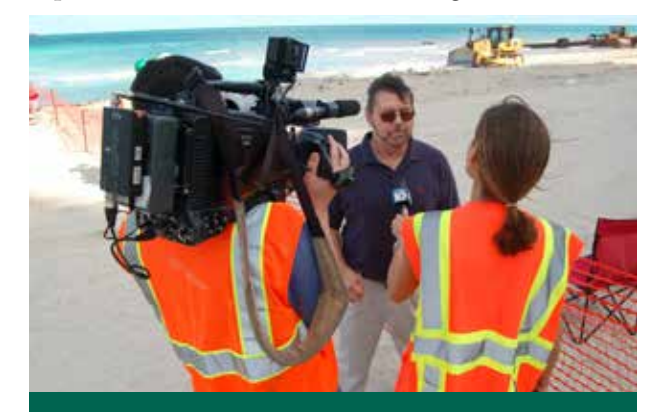
Recommendation: Communicate the risks related to climate change.

passenger rail and intercity bus terminals) and connectors critical to the mobility of people and freight and the region's economic competitiveness and quality of life (map included in Appendix D); and evacuation routes adopted under the Statewide Regional Evacuation Corridor Program.