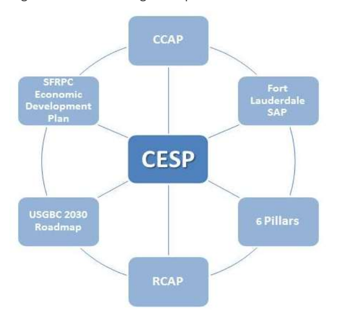
Figure 2 - Local and Regional Plans Assessed for CESP

government, adding goals for using renewable energy, reduction of energy usage, and incorporating renewable energy projects into buildings and operations." The Resolution which passed on February 4, 2014, sets goals for 20% use of energy from renewable energy sources and for 2.5% annual improvements in the energy efficiency of County buildings by 2020. To advance the resolution, a Broward County Renewable Energy Action Plan was developed to advance and encourage future renewable energy projects within county operations symbiotically with the CESP. Both plans support Broward County goals through reduction in total energy use, and in furtherance of the community's greenhouse gas (GHG) targets.